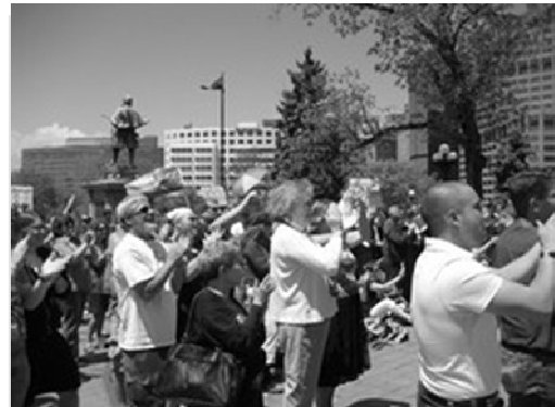
The crowd goes wild!